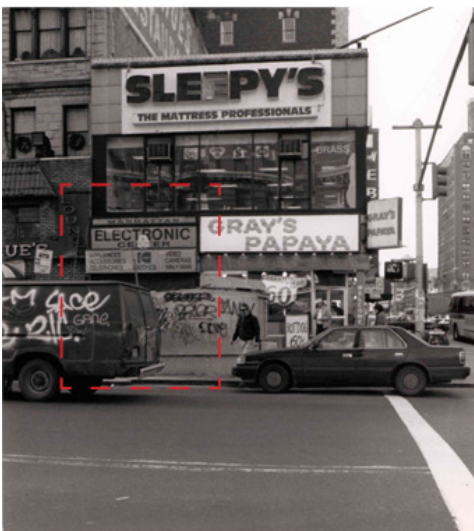
Historic Photo- 1990